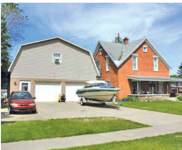
407 THIRD STREET, EAST JORDAN

Solid brick home that has been converted into 3 units. Very good tenant history. There is also a 2 car insulated finished garage. This also offers a shared laundry room in a very quiet neighborhood close to schools. MLS #444858. $99,900 Ask for Holly Nierman or Mike Stark.