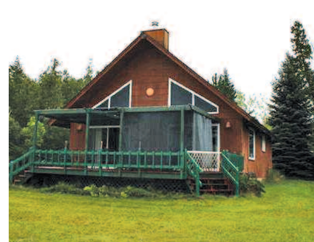
4563 MURRAY LANE • EAST JORDAN

This home is located in a quiet neighborhood and sits on approx. 5 acres with apple and pear trees surrounding it. Close enough to town for those quick trips in, but still has the country setting. This 3BR 2BA home also has a formal dining room and living room combination creating a "great room" that is perfect for family gatherings and entertaining and has a full basement that could be turned into a great extra family space. MLS #446689. $169,900. Ask for Holly Nierman or Mike Stark.