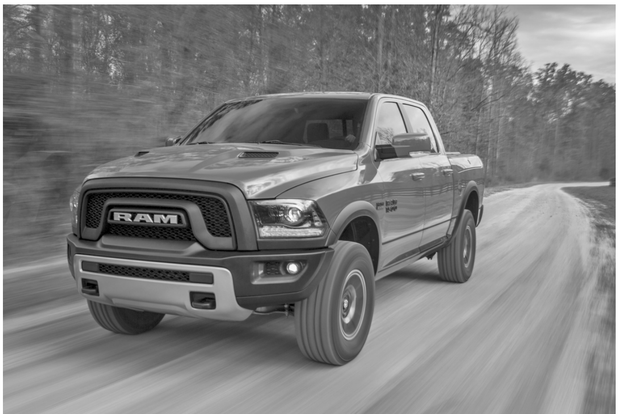
Automotive Fleet magazine announced that the Ram 1500 truck has been named its 2015 Fleet Truck of the Year, an award driven by reader input.