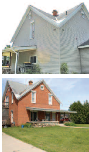
6878 BOSS ROAD • ELLSWORTH

Solid brick home that has been converted into 3 units. Very good tenant history. There is also a 2 car insulated finished garage. This also offers a shared laundry room in a very quiet neighborhood close to schools. MLS #444858. $99,900 Ask for Holly Nierman or Mike Stark.